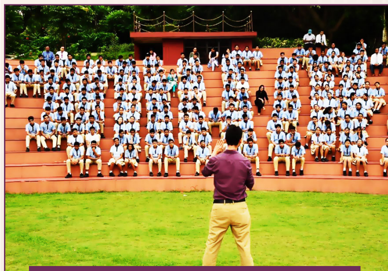
Doon International Riverside campus