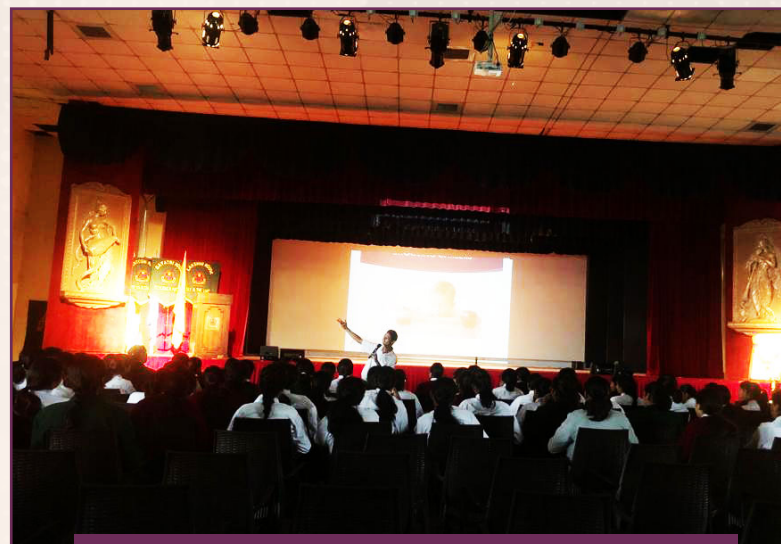
Mussoorie International School