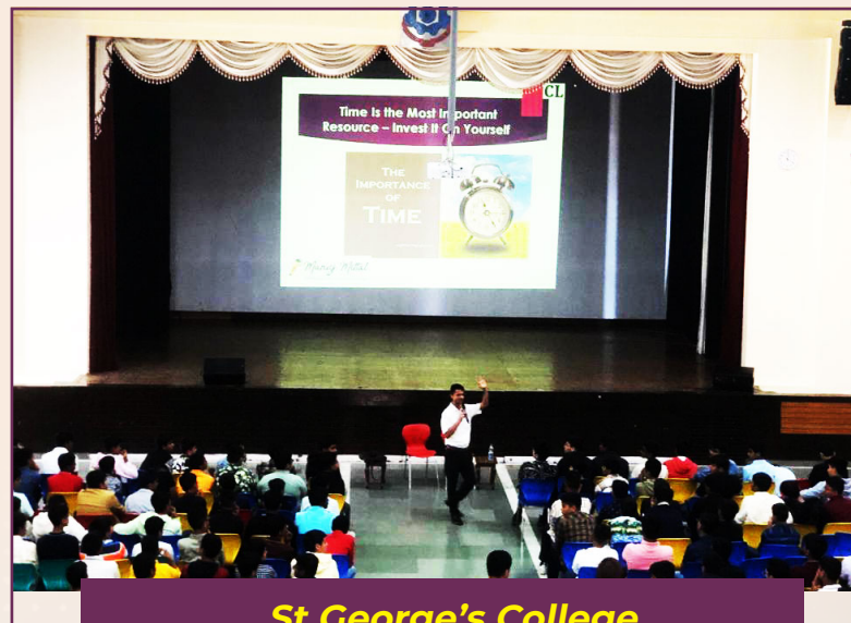
St George's College